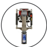
Gripple Petrol Driver

For more information contact us or visit our website www.gripple.com